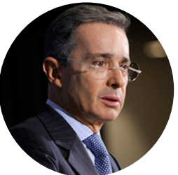
H.E. Álvaro Uribe

freedom.fiu.edu/senior-leadership-fellows/