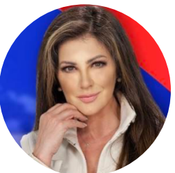
Marián de la Fuente

Former Minister of Foreign Affairs, Republic of Honduras