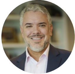
H. E. Iván Duque