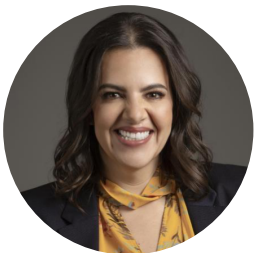
María Paula Romo Rodríguez Former Minister of Government, Republic of Ecuador www.paularomo.com